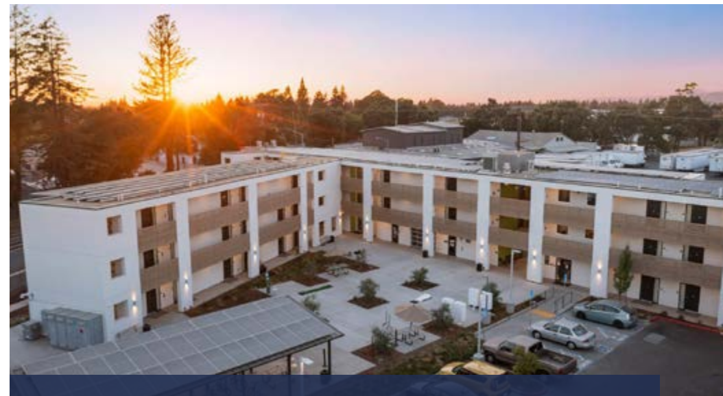
Sage Commons is a new permanent supportive housing facility with 29 units serving NPLH-eligible residents located in Santa Rosa, CA.

The debt service on the bonds sold to generate all program funding is paid for by Proposition 63 Mental Health Services Act revenues; therefore, NPLH has no ongoing costs to the state General Fund. Interest payments to bondholders and other debt service costs are capped at no more than $140 million per year.