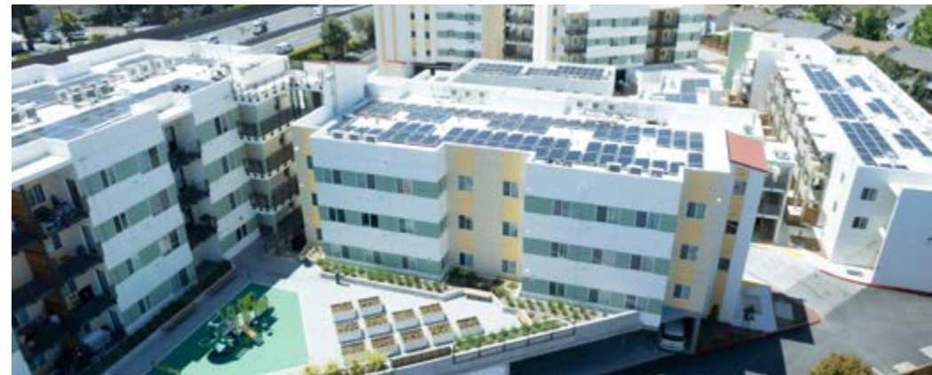
Light Tree Apartments was originally a 94-unit project in East Palo Alto, constructed in 1966. Renovations nearly double the number of homes, now providing 185 affordable homes. Phase 3 contains 57 units, with 9 units reserved for NPLH-eligible residents.