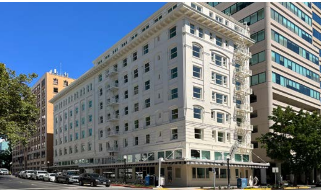
The Capitol Park Hotel in Sacramento, CA has now been transformed into permanent supportive housing for individuals who are experiencing homelessness. It has 134 total units with 65 units that are set aside for NPLH-eligible residents.