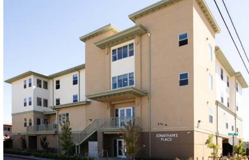
Jonathan's Place (formerly Mill Street Center), is located in San Rafael, CA and provides 32 units of permanent housing, including 15 units for NPLH-eligible residents.